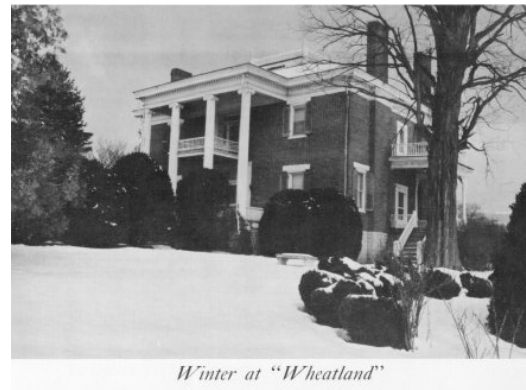
Winter at "Wheatland"